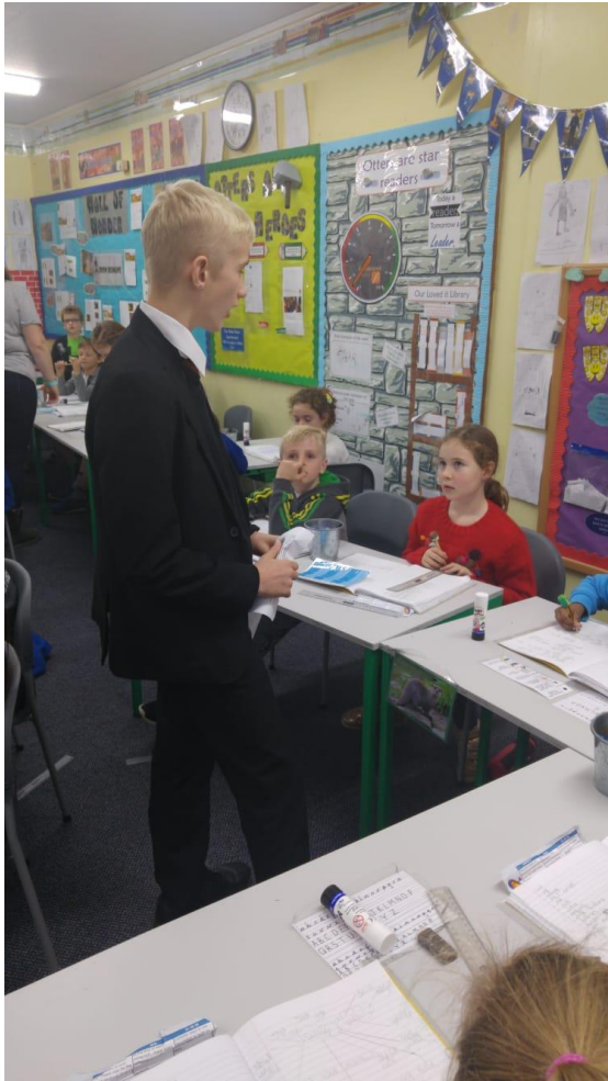
Year 8 Harvey Grammar School students advise year 3 pupils at Sandgate Primary School on 5 th December.