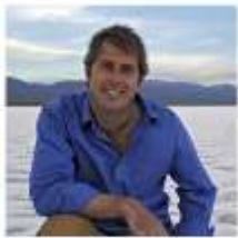
Professor Iain Stewart

On Friday 25 th November, a group of A Level Geographers from The Harvey visited the Apollo Victoria Theatre in the heart of London's West End for a Tectonic Hazards conference. With over 2,500 other Sixth Form students in attendance an expert panel inspired the audience, sharing with them contemporary research into the causes, impacts and management of a range of Tectonic Hazards.